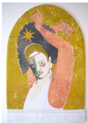
'Fire Dance' 32 x 44cm (framed) Reclaimed fabric & stitch £750