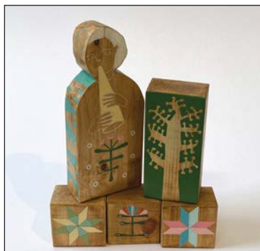
'Dream Minstrel' approx 35 x 25cm Wood collage Sold