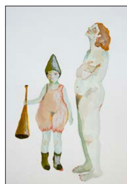
'Benbow Trumpet' 21 x 29.7cm Acrylic on paper Sold