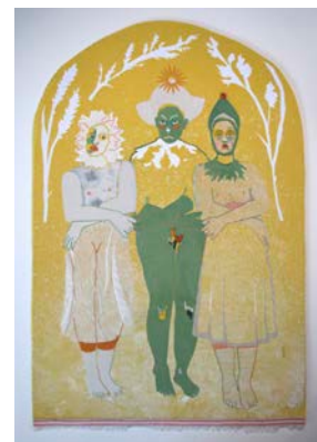
'Sun Sisters' 44x61cm (framed) Reclaimed fabric & stitch £1000