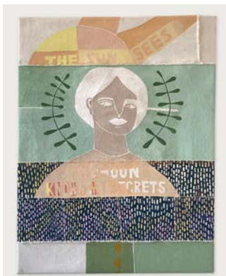
'The Moon Knows My Secrets' 65 x 50cm Acrylic on stitched canvas Sold