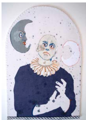
'Winter Waning' 32 x 44cm (framed) Reclaimed fabric & stitch £750