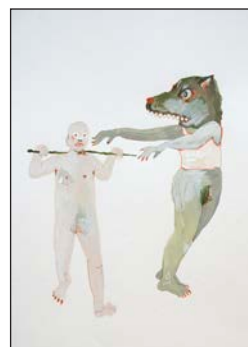
'Benbow Wolf' 21 x 29.7cm Acrylic on paper Sold