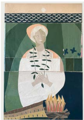
'A Sage Spring Fire' 100 x 85cm Acrylic on stitched canvas £900