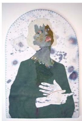
'Spring Is That Way' 32 x 44cm (framed) Reclaimed fabric & stitch £750