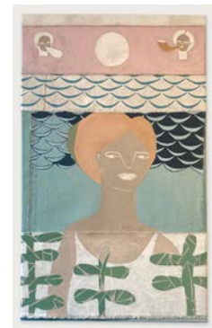
'Moon Swim with Music & Song' 85 x 50cm Acrylic on stitched canvas £700