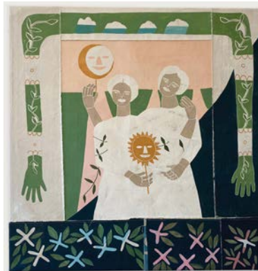
'In the Arms of Mother Kore' 110 x 105cm Acrylic on stitched canvas £1400