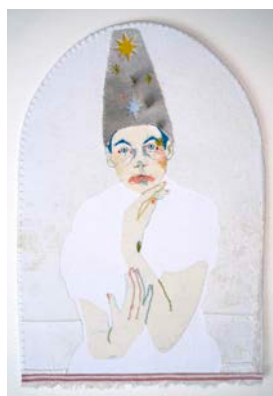
'Light-baring Being' 32 x 44cm (framed) Reclaimed fabric & stitch £750