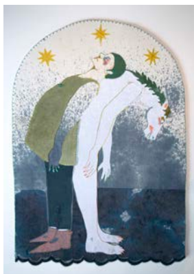
'Oss Shadows & Shallow Tides' 44 x 61cm (framed) Reclaimed fabric & stitch £1000