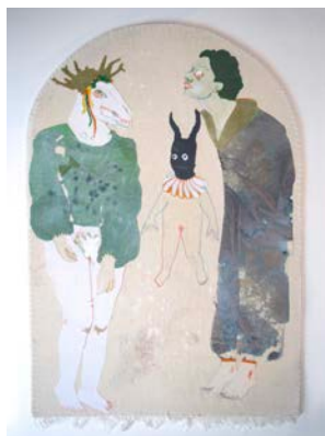
'Urchins of the Equinox' 44 x 61cm (framed) Reclaimed fabric & stitch Sold