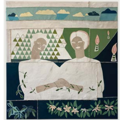
'In the Shadow of the Beacons' 110 x 105cm Acrylic on stitched canvas £1400