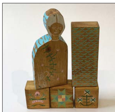
'Sooth Sayer' approx 35 x 25cm Wood collage £250