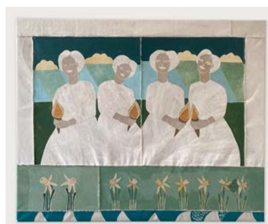
'OSTARA Trumpets' 105 x 85cm Acrylic on stitched canvas £900