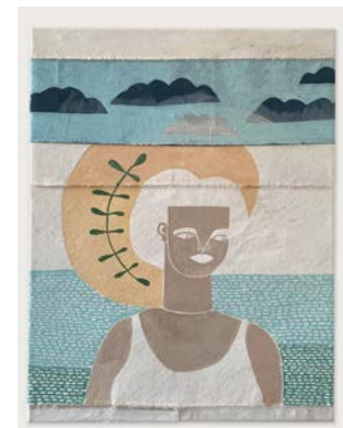
'The Sun Is My Halo' 65 x 50cm Acrylic on stitched canvas £550