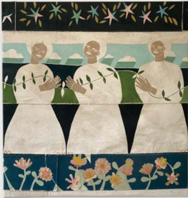
'Merry Maids of OSTARA' 110 x 105cm Acrylic on stitched canvas £1400