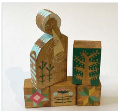
'Wind Whisperer' approx 35 x 25cm Wood collage £250