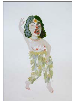
'Benbow Dancer' 21 x 29.7cm Acrylic on paper £180